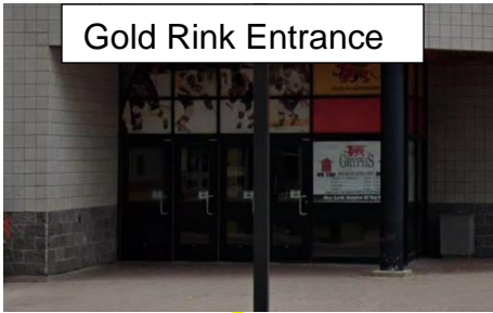
Gold Rink Entrance