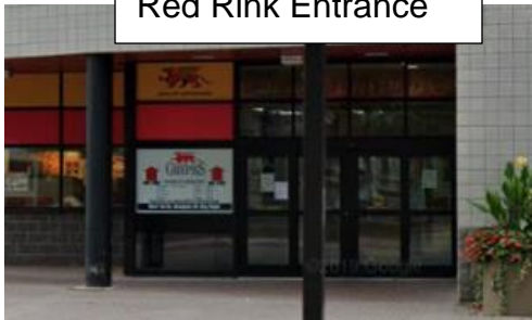
Red Rink Entrance