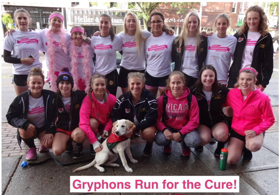
Gryphons Run for the Cure!

Congratulations to all of the girls for participating! Well done, Gryphons!